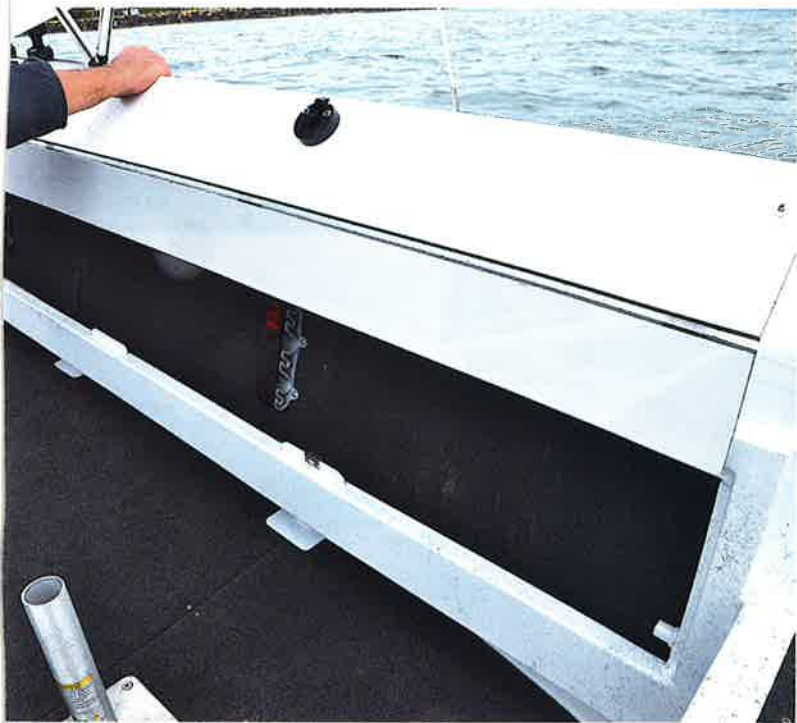
Above: The Top Ender's optional rod locker is something most serious anglers would go for without hesitation.